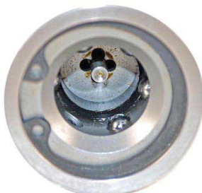
J639 High Side Vacuum & Charge